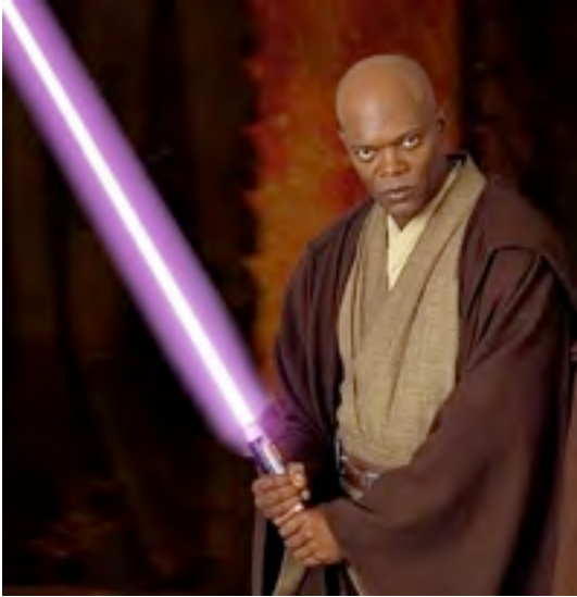
Above: Jackson limbers up on the first tee with light saber from Star Wars.

In this installment of Cool Golfers of the World, we focus on one of Hollywood's biggest stars, Samuel L. Jackson. Star of blockbusters such as Pulp Fiction, Jurassic Park, Star Wars and The Matrix, Jackson is a golfing fanatic and, playing off a handicap of 4.9, says he might have made it as a pro if he hadn't been successful at acting. So keen is he on the game that he has a clause in all his movie contracts that allows him to play golf every other day during shooting. In