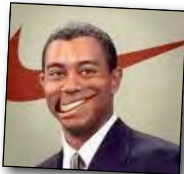
Tiger's endorsements: No laughing matter!

Drink hadn't been taken, the driving range is closed at 2:30am and he wasn't working nights. So how come one of the world's most physically well coordinated men drove his car into a tree a few yards from his own house? Perhaps he was still wearing his spikes and his foot slipped on the pedal. Or his practice balls had escaped and were rolling around his feet - it's happened to us all. The world's press has speculated at length but the BV Newsletter thinks there are