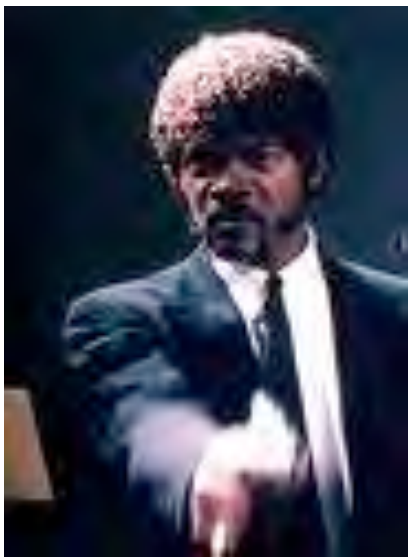
Good shot! Jackson in Pulp Fiction.

fact, he says "films get in the way of my golf, but they have afforded me the chance to play a lot of golf." Another reason for enjoying golf, he says, is that the golf course is the only place where he can "go dressed as a pimp and fit in perfectly".